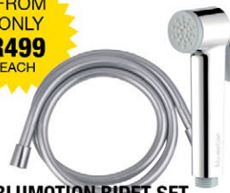
BLUMOTION BIDET SET (ISTINJA HOSE) AVAILABLE IN BLACK AND CHROME